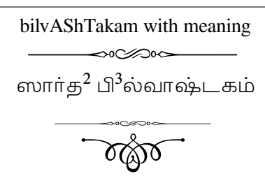
by N. Balasubramanian bbalu at satyam.net.in

Introduction: This is a short poem consisting of ten verses. The first nine verses speak of the glory of the bilva leaves. The leaves are considered sacred and are particularly suited for offering to Shiva. They are to be offered in cluster of three leaves and are said to have features that identify them with the Lord Himself. The tenth verse gives the benefit of reading the poem and is known as the \ensuremath{\square^2} suring \ensuremath{\mathbb{R}} : \ensuremath{\mathbb{R}}