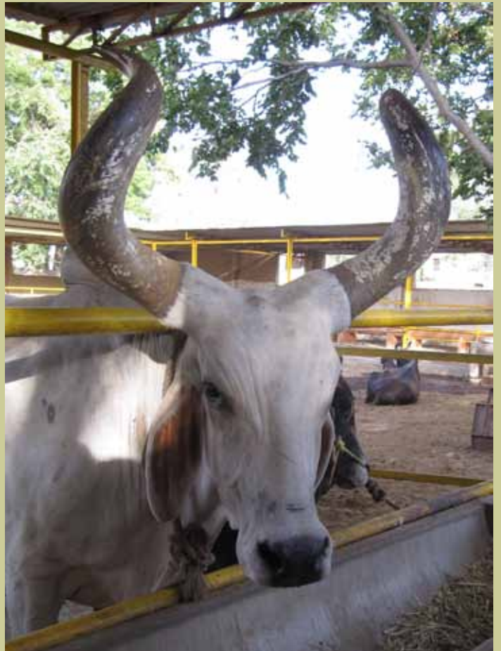
Govinda and Vitthal resting at the Goshala in Vrindavan