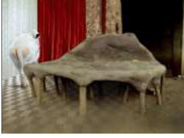
Cow Dung Gasoline - Japan Dry Cow Dung Smell

Mixture of Cow Dung, clay, sand creates a material like concrete but softer, cool in summer and warm in winter