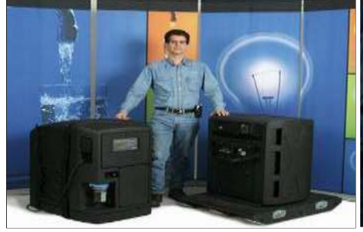
Segway Scooter - Sterling Engine -Dean Kamen